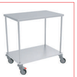
Instrument Trolley NEO 2011.01