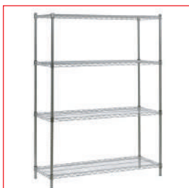
Wire Shelf Systems NEO 0701.06