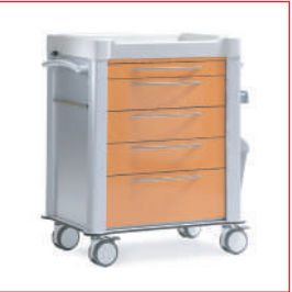
Dressing Cart NEO 0601.04