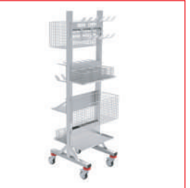
Mobile Hook Rack NEO 2011.05