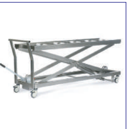
Cadaver Lift (Hydraulic) NEO 0701.01