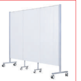
Folding Screen NEO 0701.14