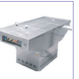
Dissection Table NEO 0701.03