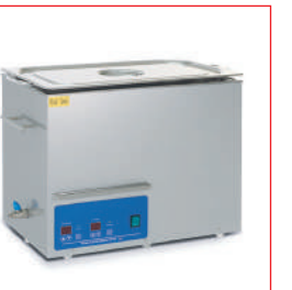
Tabletop Ultrasonic Cleaner NEO 0701.04