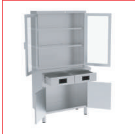
Instrument Cabinet NEO 1109.01