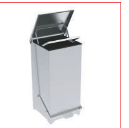
Waste Receptacle NEO 2011.08