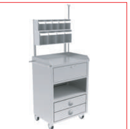
Drug and Anesthesia Cart NEO 0312.03