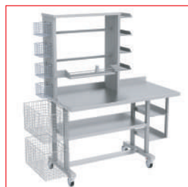
Work Station NEO 2611.01