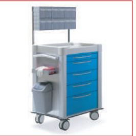
Anesthesia Cart NEO 0601.05