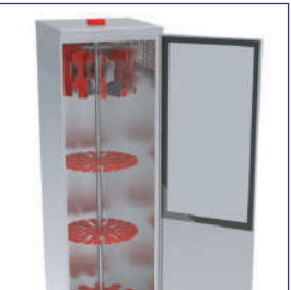
Endoscopy Cabinet NEO 2012.04