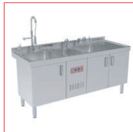
Ultrasonic Cleaner Counter NEO 1709.01