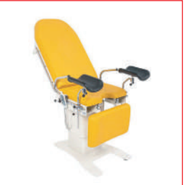
Gyneocological Couch NEO 0701.13