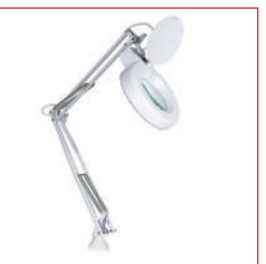
LED Magnifying Lamp NEO 0701.07