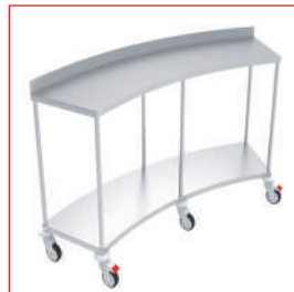
Falcate Table NEO 2011.02