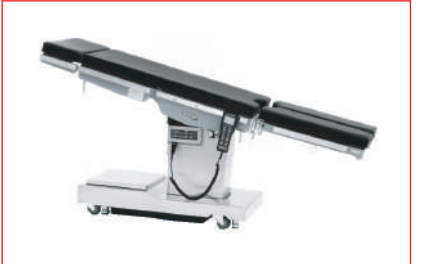
General Surgery Operation Table NEO 0601.03