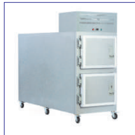
Morgue Unit (Double-Front Door) NEO 2512.05