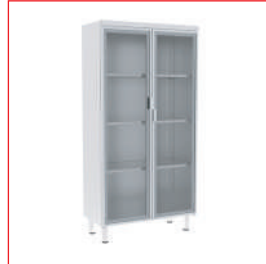
Instrument & Medicine Cabinet NEO 1512.01