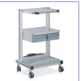
Medical Device Cart NEO 0701.18