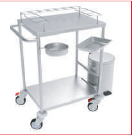
Dressing Trolley (Multifunctional) NEO 2011.04