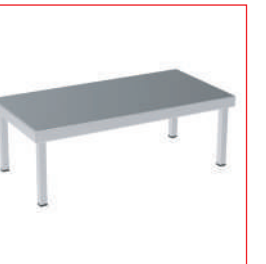
Foot Step (Single) NEO 2711.01