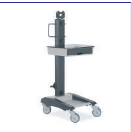
Medical Device Cart NEO 0701.17