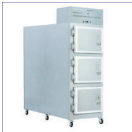
Morgue Unit (Triple-Front Door) NEO 2512.07