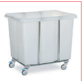
Linen Trolley (PE) NEO 0701.09