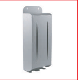
Brush Dispenser (20 pcs) NEO 0312.01