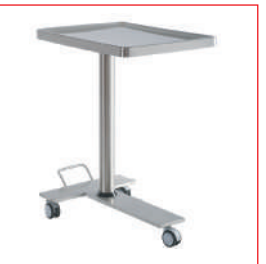
Mayo Table (Hydraulic) NEO 2012.07