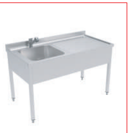
Instrument Washing Sink (Single) NEO 1709.02