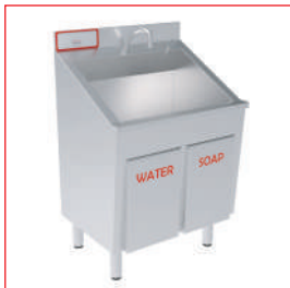
Surgical Scrub Unit (Single) NEO 2711.05