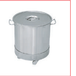
Kick Bucket NEO 0701.05