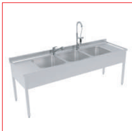
Instrument Washing Sink (Triple) NEO 1709.04