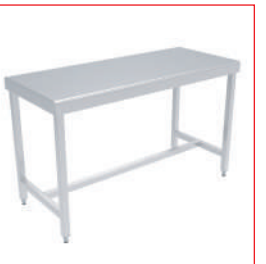
Working Table NEO 2611.02