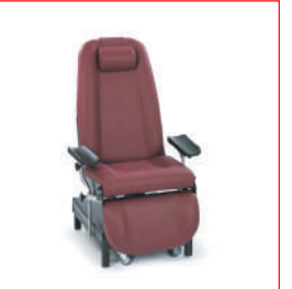
Blood Draw Chair NEO 0701.12