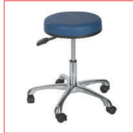
Surgical Stool (w/o backrest) NEO 0601.01