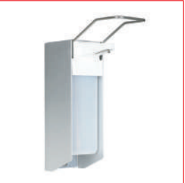
Liquid Soap Dispenser NEO 0701.11