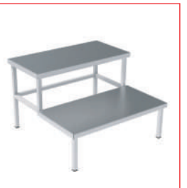
Foot Step (Double) NEO 2711.02