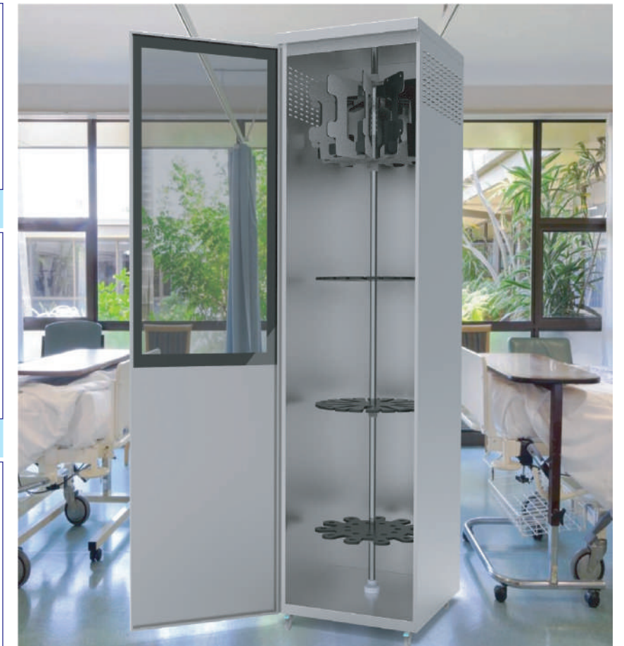
Endoscopy Cabinet NEO 2012.04

Stainless Steel 304 Quality 11 pcs endoscope storage capacity Rotating system for easy access, 700x700x2200Hmm 4 Castors with 2 brakes Drainage tray for water accumulation under the cabinet