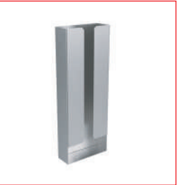
Brush Dispenser (10pcs) NEO 0312.02