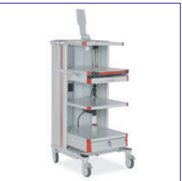
Visual Cart NEO 0701.15