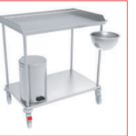
Dressing Trolley NEO 2011.03