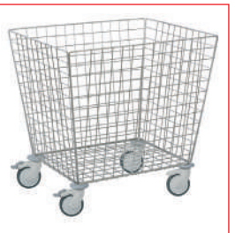
Mobile Wire Basket NEO 0701.10