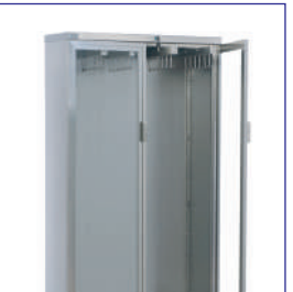
Catheter Cabinet NEO 0701.19