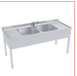
Instrument Washing Sink (Double) NEO 1709.03