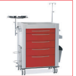
Emergency (Crash) Cart NEO 0601.06