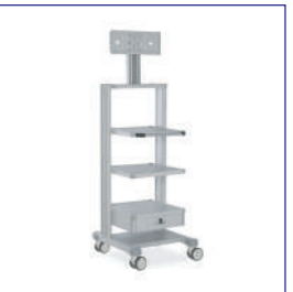
Medical Device Cart NEO 0701.16