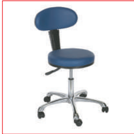
Surgical Stool (w/ backrest) NEO 0601.02