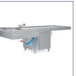
Autopsy Table NEO 0701.02