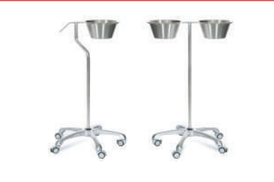
Basin Stands (Single - Double) NEO 2512.01 - NEO 2512.02